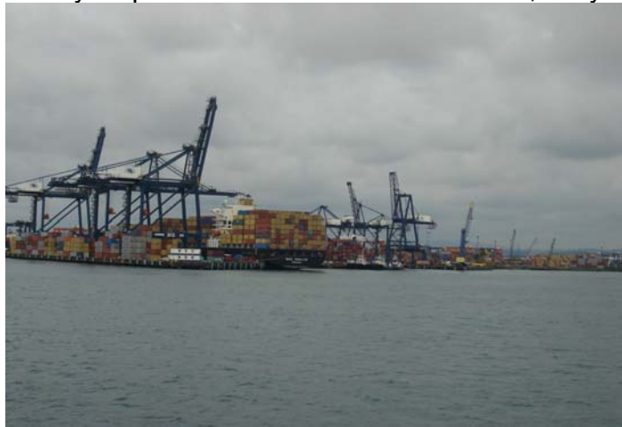
Near the Miraflores Locks, containers are being off-loaded to the terminal deck.