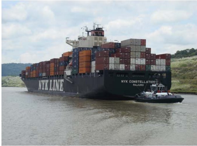
Although traffic within the canal has decreased significantly in 2009, many ships such as this transit the canal, daily.