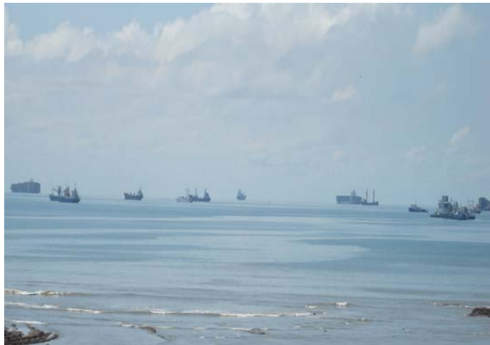
In the distance, ships wait to enter the Pacific side entrance to the canal.